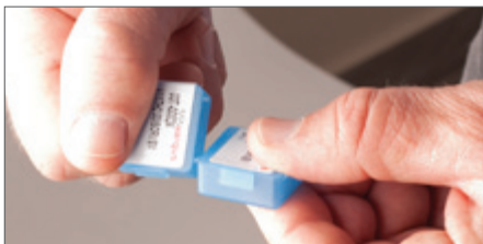
Snap-off for simple handling